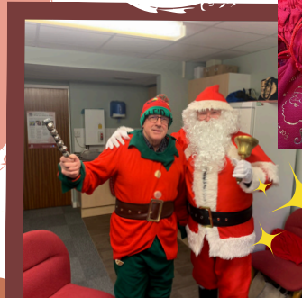
We hope the children loved their personalised gifts from Santa this year.

Contribution towards Torpel trip to London