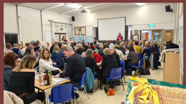
Quiz and curry night

Torpel kindly raised our donation and an extra £327 for Macmillan Cancer Support. An additional £788 was raised for children's cancer charity, Adele's Princess Wish, at the quiz and curry night.